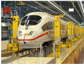
Lifting Jacks for Trains/Coaches

Lifting jacks for lifting / lowering complete rail cars (trains) / Bogies for maintenance and repair work. Different technical designs - according to the requirements of the client.