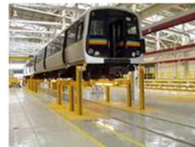
Underfloor Lifting System (Cantilever Design)

"Underfloor" mounted special lifting system designed for lifting / lowering complete trains or single rail cars and locomotives for maintenance and repair work as well as for replacement of components. The lifting system and car body supports/stands are designed according to the special requirements of the clients. The initial state of the complete unit is floor level which allows the unobstructed use and passing of the main floor level.