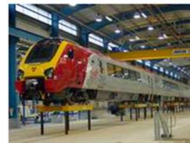
Underfloor Lifting System (Column Design)

With this kind of lifting system the bogies to be replaced... more >>