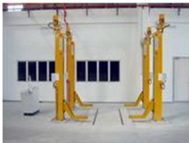
Lifting Jacks for Bogies/Powerpacks

Lifting jacks for lifting / lowering complete rail cars (trains)... more >>