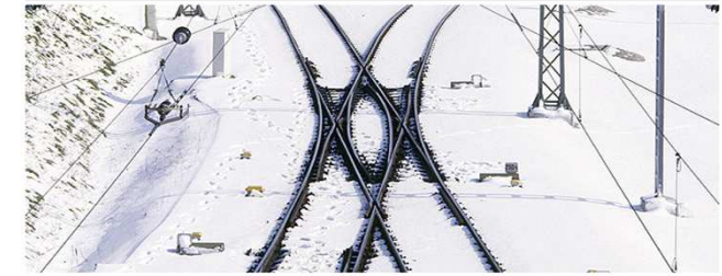
Point heating systems